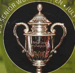
U.S. SENIOR WOMEN'S OPEN • JULY 12-15