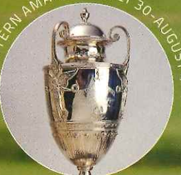
WESTERN AMATEUR • JULY 30-AUGUST 4