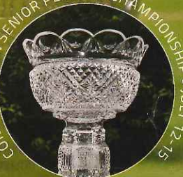
CONSTELLATION SENIOR PLAYERS CHAMPIONSHIP • JULY 12-15