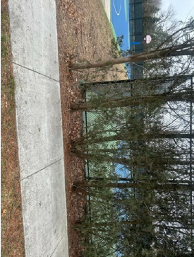
Proposed Corner Gate Location Photo 2