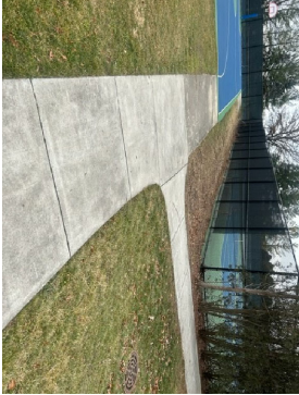
Proposed Corner Gate Location Photo 3

PROJECT TITLE: 2023 Cunniff Park Pickleball Courts Fencing Improvements Project