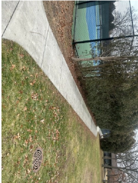
Proposed Corner Gate Location Photo 1